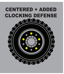
INSTALL 5 Wheel centering inserts, one on every-other stud.