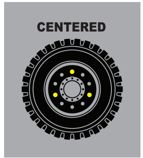
INSTALL 3 Wheel centering inserts, on opposing studs, forming a triangle.